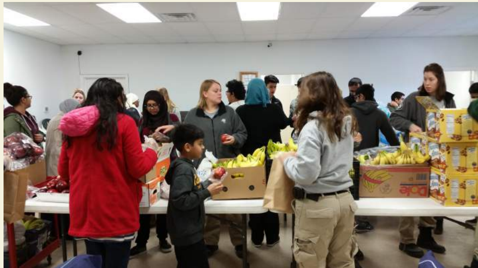
Volunteers at the National Day of Service event on MLK Day

By organizing monthly meaningful and impactful volunteer projects as well as holding leadership training workshops, we are paving the way for our youth to grow into compassionate, socially engaged and active leaders for society.